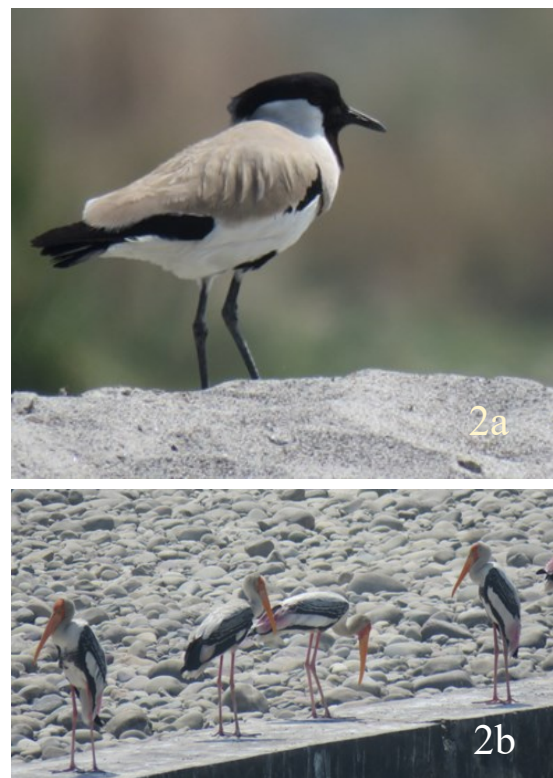
Figure 2. Near Threaten (IUCN) River lapwing ( Vanellus duvaucelii ) (2a) and Painted stork ( Mycteria leucocephala ) (2b) water bird species reported in Haiderpur wetland site.

birds in Haiderpur wetland also indicates availability of rich food sources and vegetation cover for shelters to the bird species. The variety of food availability and safe shelter sites influences the avian diversity in the habitat (Terborgh 1977; Wiens and Rotenberry 1981; Rajpar et al. , 2011; Joshi et al. , 2015).