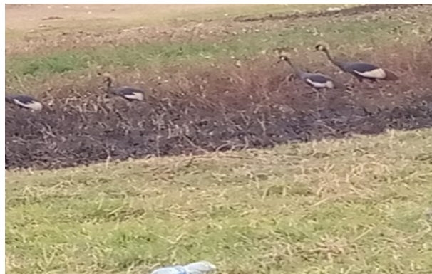
e) Black Crone Crane