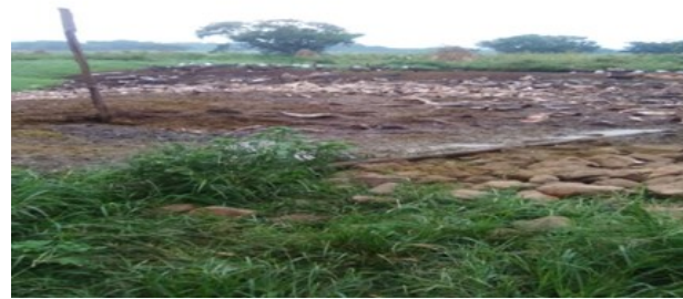
d) Abattoir site