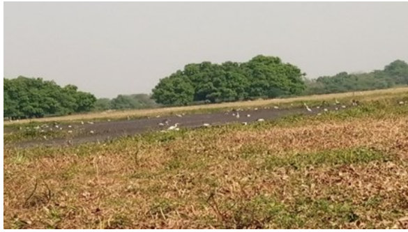
a) Wetland site in dry season