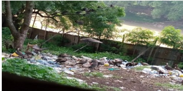
c) Dump site