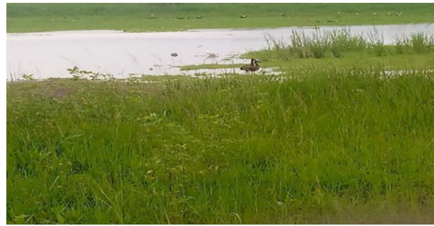
b) Wetland site in wet