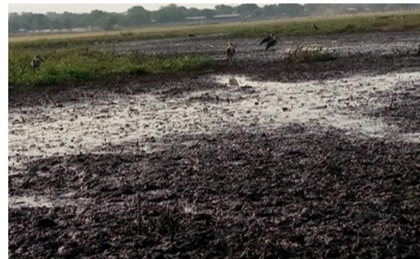
f) Marabou Stork