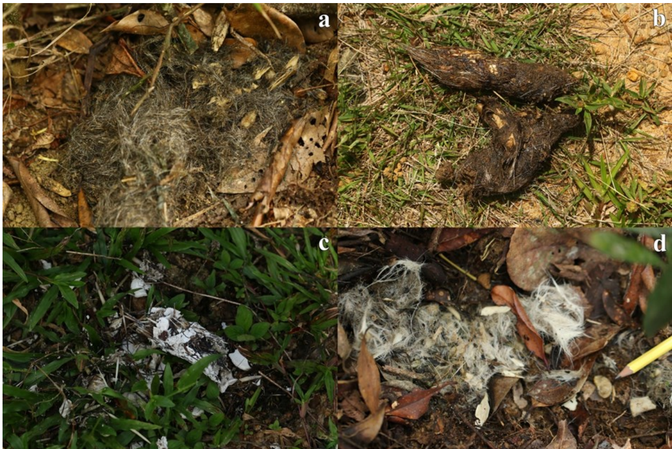
Figure 2. Scat containing particles of various prey species (a) Sambar, (b) Wild boar, (c) Indian porcupine, (d) dog