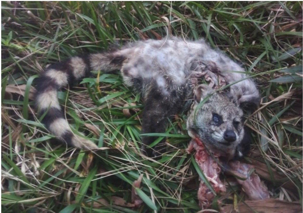
Figure 3. Partially eaten carcass of a ring-tailed civet