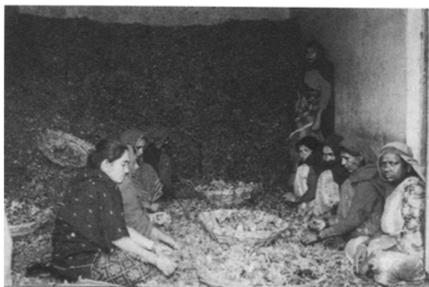
Figure 2. Lichen materials sorted, graded, and baled at Ramnagar. Adapted from “Commercial and ethnic use of lichens in India,” (Upreti et al. , 2005).